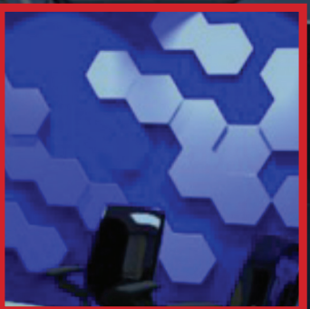
ACOUSTIC TILE WALL