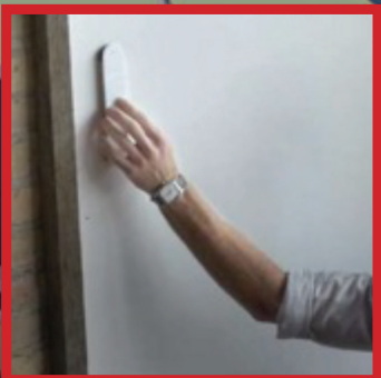
MARKER RETRACE SYSTEM

Engineered from inside out, designers, certified sound engineers and audio visual technicians come together to ensure optimal performance, with continual Bri-Tech support beyond the completion of your project.